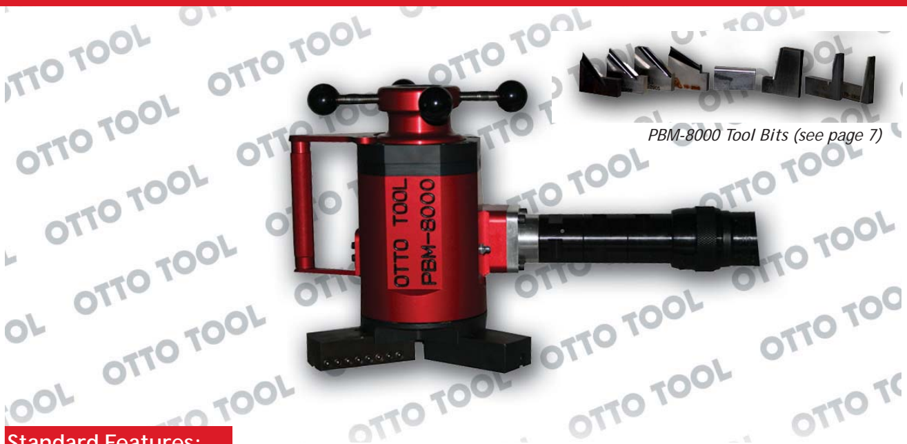
PBM-8000 Tool Bits (see page 7)

This 8" pipe beveling machine comes with a torque accepting mandrel and a worm gear drive unit for extra torque, to handle extra thick pipe walls. Our machine is one of the only machines on the market that can bevel, face, and counter-bore 2" wall. The pneumatic air motor is a 3 hp. Air required: 70 CFM and 90 psi.