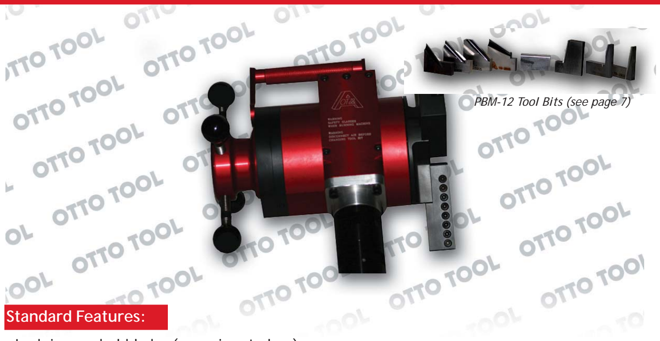
PBM-12 Tool Bits (see page 7)

This 12" pipe beveling machine comes with a torque accepting mandrel and a worm gear drive unit for extra torque, to handle extra thick pipe walls. Our machine is one of the only machines on the market that can bevel, face, and counter-bore 2" wall. The pneumatic air motor is a 3 hp. Air required: 70 CFM and 90 psi.