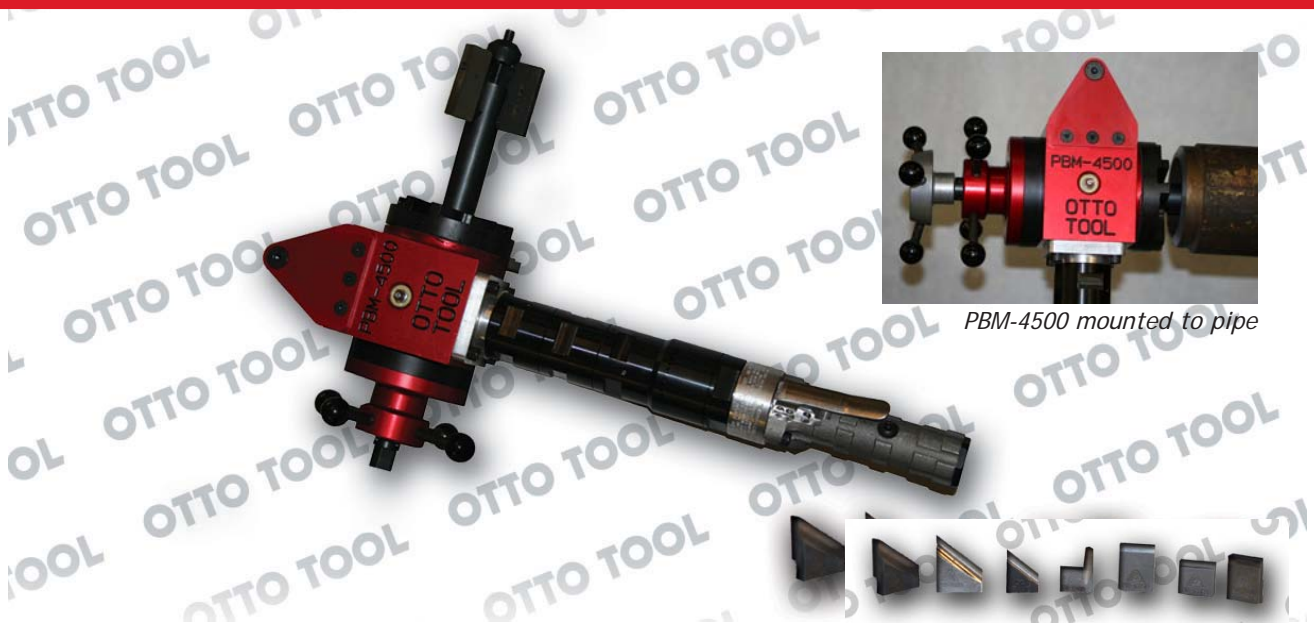
PBM-4500 mounted to pipe

This 4" pipe beveling machine comes with a torque accepting mandrel and is built with a worm gear drive unit for extra torque, to handle extra thick pipe walls. Our machine is one of the only machines on the market that can bevel, face, and counter-bore 1" wall. The pneumatic air motor is a 1-5/8 hp. Air required: 55 CFM and 90 psi.