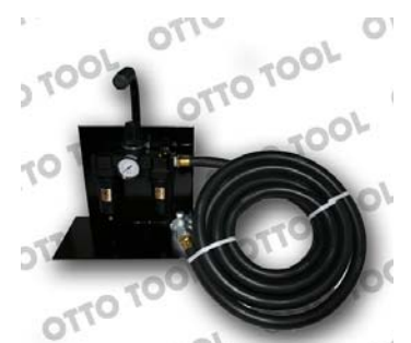
Air Caddy - optional with all PBM machines

Air Caddy - includes air regulator, filter & oil mister P/N: PBM-AF