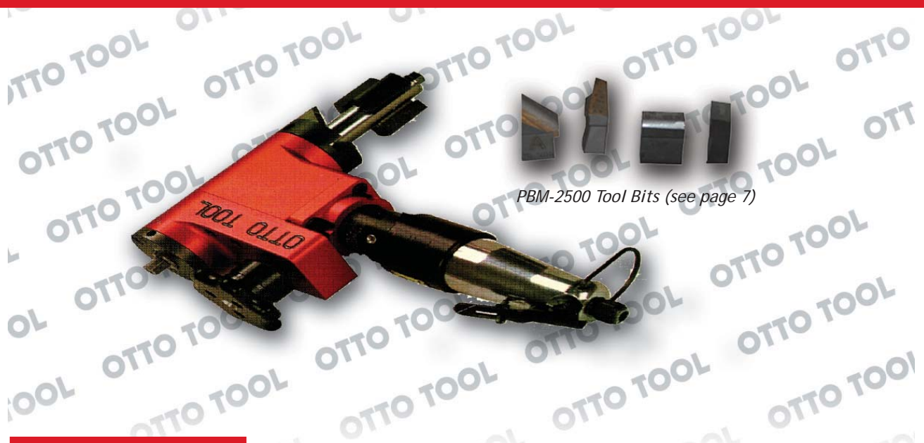
PBM-2500 Tool Bits (see page 7)

The Boiler Bull-Dog Beveling machine comes with a torque accepting mandrel that makes this lightweight portable I.D. tool perfect for beveling boiler tube or any close quarters space that most other beveling will not fit. This tool works with high speed tool steel bits, either a 3/8" thick tool bit with "wedge lock tool bit system" or 1/4" thick tool bit without our wedge lock system.